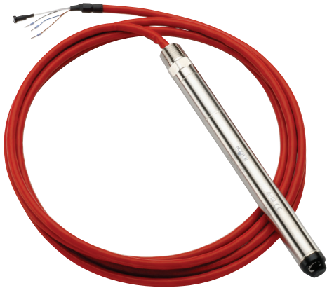
Shown with optional NPT conduit and optional FEP cable